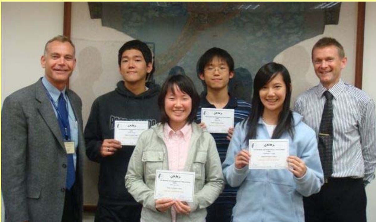
Gold Certificate Winners for the Senior Mathematical Challenge held in November.